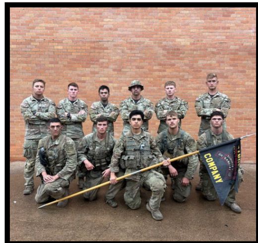
2024 Ranger Company Cadets