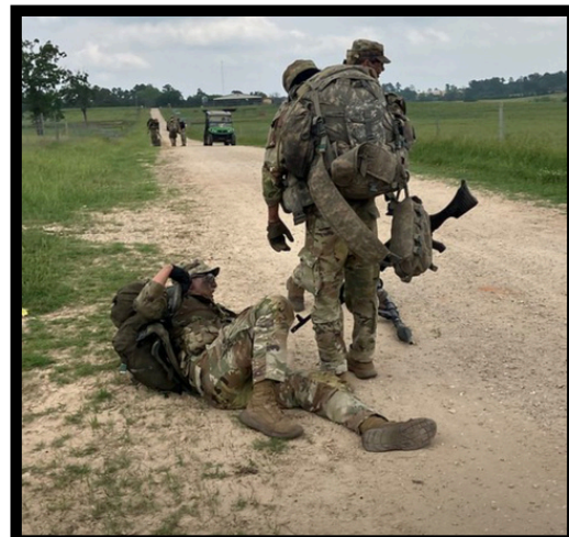
Ranger Company Candidates never leaving a fallen comrade