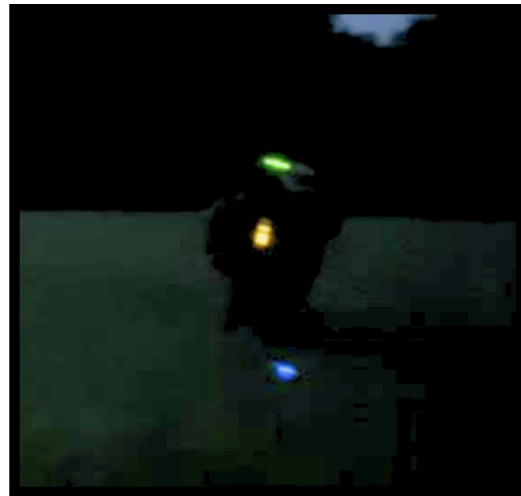
Ranger Company Candidates conducting a movement under the cover of darkness