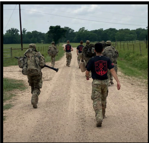
Ranger Company Candidates Conducting a Movement through Hostile Territory