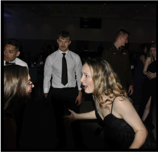
Cadets on the dance floor and having a good time.