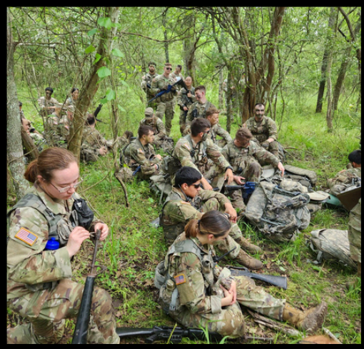
Cadets preparing for the next Mission

During the last tactical lab of the Spring Semester, the Bearkat Battalion has conducted the annual Super Lab, extending beyond the normal lab time and into the night. With this opportunity, Cadets ran two consecutive battle drill lanes to simulate missions at Cadet Summer Training. With additional time to plan and execute their mission, Bearkat Cadets had a final opportunity to learn and develop their leadership skills before the semester ended.