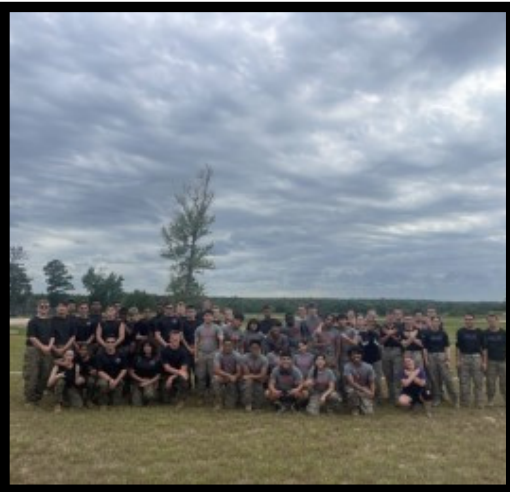
The Cypress Spring, Ridge Point, and Willis High School JROTC Cadets.