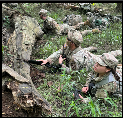
Cadets in the prone position waiting for orders to attack