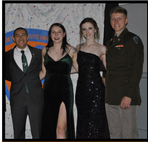
The Senior Cadet Leadership and their dates.

On April 13th, 2024, Sam Houston State University's Lomen Student Center was the venue for the distinguished ROTC Military Ball, an evening dedicated to honoring our nation's military traditions and the valor of its service members. The ROTC Military Ball not only served as a solemn tribute but also provided a wonderful opportunity for the Cadets to foster camaraderie in a relaxed and celebratory setting. Away from the usual rigors of training and academic responsibilities, Cadets relished the chance to see each other dressed in their formal military attire, adding a sense of pride and tradition to the friendly atmosphere.