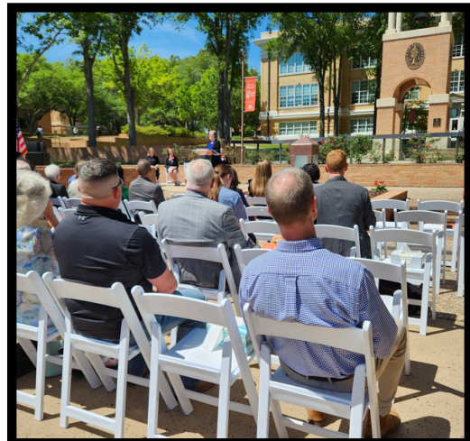
Attendees at Ravens Call